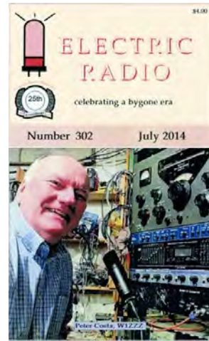
On the cover of Electric Radio magazine!