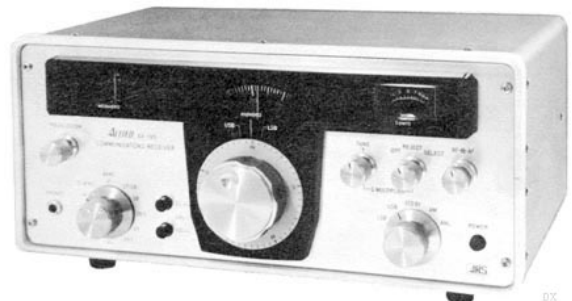
Allied Radio Shack AX-190 ham receiver

AX190 shortwave receiver. Carrying that to the car was a challenge, as I could not use my right hand fully, so I used my left hand and right arm!