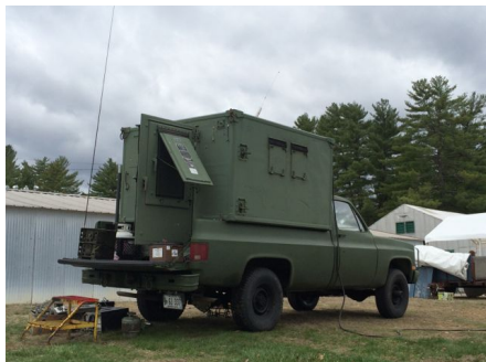
A military truck with tube gear inside!

I took the day off Friday May 1, and under chilly weather we arrived at the flea by 2PM. Having a leisurely walk through the fairgrounds, I enjoyed seeing electronic components, vintage radios, modern rigs, antennas, computers and most anything else you may be interested in. Oh yes, there were many eyeball QSOs with radio friends and acquaintances-including a number of WARS members. It was interesting to discover that most of my radio friends knew about my broken wrist even though I have not been on