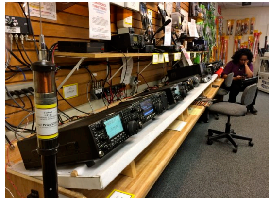
The latest “candy” at Ham Radio Outlet