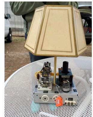
A tube radio lamp!