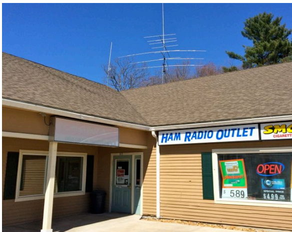
Ham Radio Outlet in Salem, NH