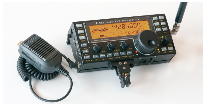
Elecraft KX3 QRP Transceiver

Wonder if we'll do as well at the Fall Near-Fest?